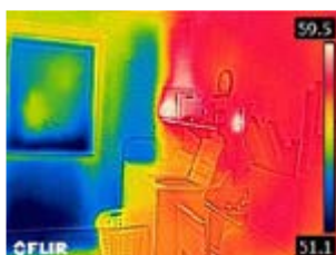
Uninsulated outside wall