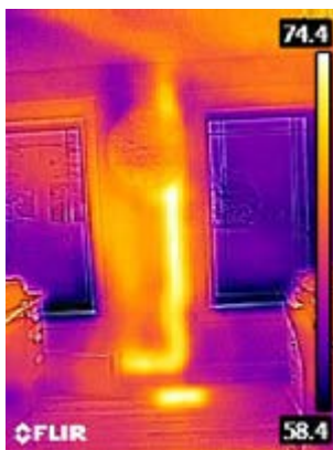
Warm drain pipe in wall